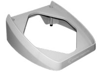
SmartView™ Platform p/n 00-079-009-001